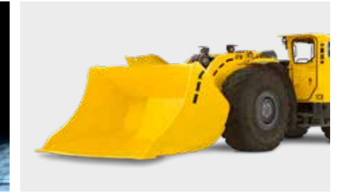
Innovative boom/bucket design and load-sensing hydraulics ensures one-pass mucking while minimizing the fuel consumption.