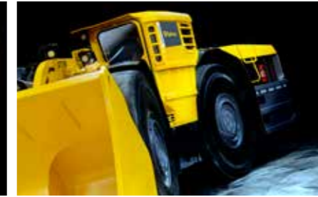
Smart built-in features such as traction control and over speed protection will contribute getting the most out of the Scooptram ST18 while protecting your investments.