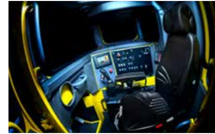
The comfortable, ROPS and FOPS certified cabin is air conditioned and features the unique Epiroc footbox to maximize leg room.

First-class working environment with Scooptram ST18 as the operator can count on a spacious cabin, ergonomic controls, dual ride control and soft stop for steering and boom movements.